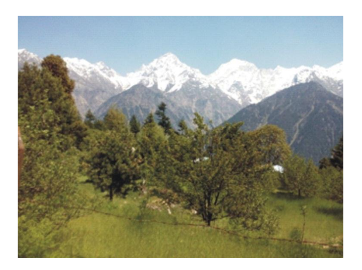
Figure 1: Field at Kalpa

with the help of tools. The major crops grown are potato, peas, wheat, barley, and beans. Some also grow vegetables such as turnips, reddish, cabbage etc. The fields are ploughed and leveled with the help of a spade like tool called fawda or charupp. The beds for seed sowing are prepared by the women with the help of another tool made out of wood. The sowing usually takes place in last week of March or early April. About 35-45 days after sowing, the germination takes place and the first round of weeding is done by the women; followed by irrigation of the crop. Later the weeding and irrigation are repeated after each week till maturity. The crops are harvested usually in the last week of September or early October. It is then brought home for drying, thrashing and storage. While most people only grow for their own consumption, few are able to sell their crops at local market. The harvest is stored for consumption during the winter months when the majority of the areas of the district remain cutoff from rest of the state due to heavy snowfall.