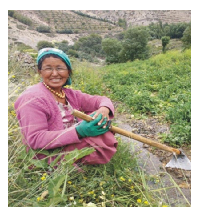
Figure 2: A lady from Hango irrigating pea crop

cannot be afforded by everyone and therefore the traditional method still stands superior. Also the modern irrigation systems have failed to be as efficient as the kuhl system. It was reported that the pipes used for irrigation sometimes burst or are damaged during the freezing winters. There is another major inconvenience of unequal water distribution along the gradient with the plants at higher slope receiving no or very less water.